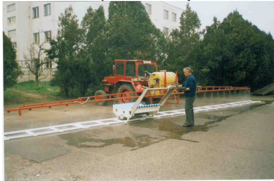
Figure1. Checking the uniformity of distribution of the EEP 500 equipment with the stand designed by INMA

The stand that is an easy to move modular construction of small dimensions made of anticorrosive material, allows obtaining and registering the values for nozzle flow rates and variation of distribution uniformity on the working width.