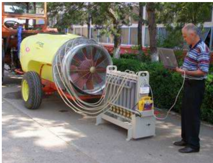
Figure 2. Testing the functional parameters of an air-assisted sprayer ATOM 1000, with the help of the stand built

The determination of the flow rates per nozzles, in the case of this stand too, is based upon the measurement of the time needed to fill in constant volumes.