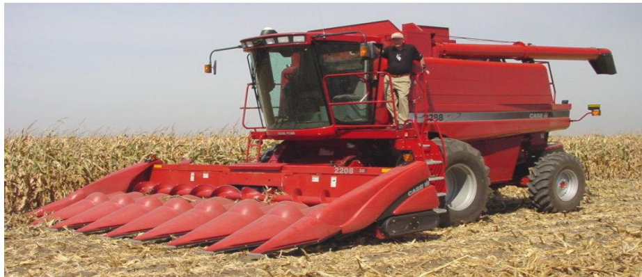
Fig. 1. CASE-IH 7088 + CS-8 combine

The self-propelled CASE-IH 7088 combine (Figure 1) is equipped with a CS-8 maize cob chopper for eight rows.