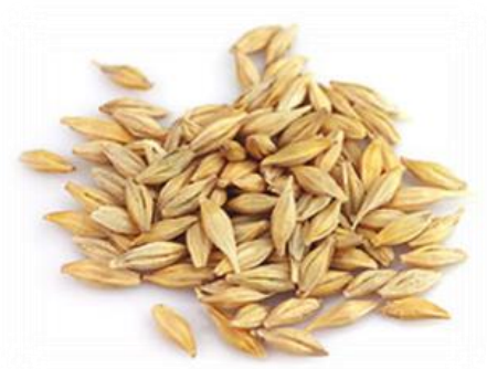
Figure 2. Neda ( https://agrodimeks.com/ )