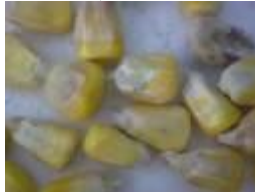
Figure 4. Mycelium of Penicillium sp.