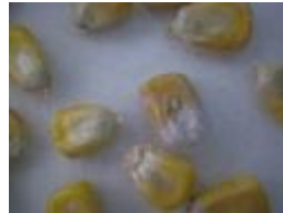
Figure 2. Mycelium of Fusarium graminearum