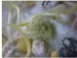
Figure 1. Mycelium of Aspergillus flavus

fungi that have grown on the surface of the seeds placed in Petri plates. At the surface of the grains from humid chambers were developed fungi from the following genera: Fusarium , Aspergillus , Penicillium , Alternaria and Helminthosporium (figures 1, 2, 3 and 4).