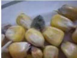
Figure 3. Mycelium of Alternaria sp.