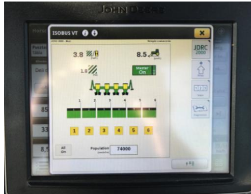
Figure 2. Planter on the Virtual Terminal

Figure 1 shows the ISOBUS connection of the tractor (right side) to which the “smartened up” machine can be connected. The controlling computers of the tractor and the planter maintain direct data flow via this connection. Based on the exact geographical coordinates the controller of the tractor can send commands on switching the sections on or off. The current installation of Rate Controller 2000 makes unidirectional information flow possible: the tractor sends commands to the machine.