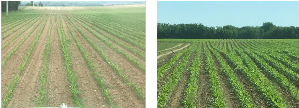
Figure 5. Result of section control

By using the control system described in this article traditional seeders can be engaged in precision farming. The same quantity and quality of products can be achieved by decreased use of labour and input material in case of applying section control.