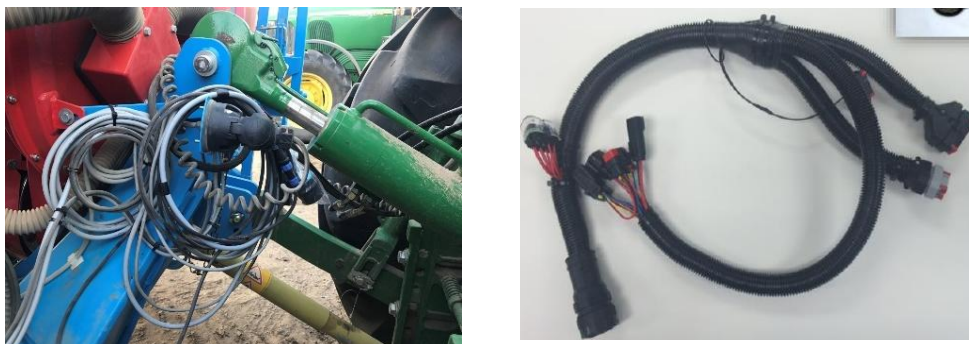
Figure 1. ISOBUS connection and wire harness

The John Deere 6R Series tractor used for section control has everything that is needed for this task (i.e. RTK, ISOBUS and activated AMS application). Section control is provided by installing the John Deere Rate Controller 2000. The tractor accesses this controller via the ISOBUS connection. Sections of the Monosem NG4 Plus conventional planter can be electronically controlled by hand. The Rate Controller 2000 performs automatically the task of switching sections on and off according to the commands received through the ISOBUS. After the system configuration the tractor is able to identify the planter and recognises its parameters (i.e. type, number of sections, physical dimensions).