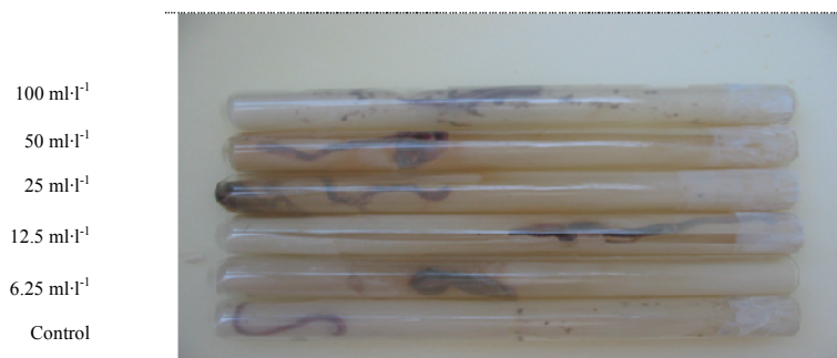
Figure 2. Acute toxicity test of the herbicide GARDOPRIM PLUS GOLD 500 SC, different levels of concentrations (ml·l -1 ) on species Eisenia foetida (Savigny, 1826) (red worm, compost worm), 24 h

Exposing the earthworms to the action of herbicide GARDOPRIM PLUS GOLD 500 SC, for five concentrations (6,25 ml·l -1 , 12,5 ml·l -1 , 25 ml·l -1 , 50 ml·l -1 , 100 ml·l -1 ), there was found after 24 test hours that all earthworms died in all test vials, for all tested concentration levels (figure 2).