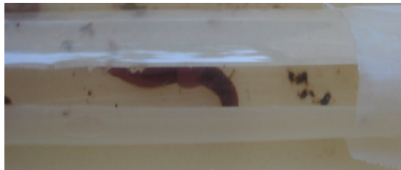
Figure 1. Vial for testing the toxicity of the herbicide GARDOPRIM PLUS GOLD 500 in species Eisenia foetida (Savigny, 1826) (red worm, compost worm)

The ecotoxicity testing of the herbicides on earthworms was realised according to OECD methodology, on filter paper [12]. The tested earthworm species was Eisenia foetida (Savigny, 1826) (red worm, compost worm). Glass vials coated with filter paper were used, with appropriate sizes so that they don't overlap in the vial. Two types of vials were used: control vials and test vials. The herbicide in suspension was dissolved in distilled water, resulting five concentration levels in geometrical series, correspondent to those used in practice (or closed) in the cultures suitable for the treatment with such a product. One millilitre of each solution was introduced in each test vial, after what the vials were placed in horizontal position in front of a slow air stream ventilated until the filter paper from inside was dry. After drying, in each test vial was added 1 ml of distilled water to wet the filter paper. In the control vial, the filter paper was wetted only with 1 ml of distilled water. Immediately after distilled water was added, the vials were closed with plastic foil and then perforated to allow the earthworm access to oxygen (figure 1).