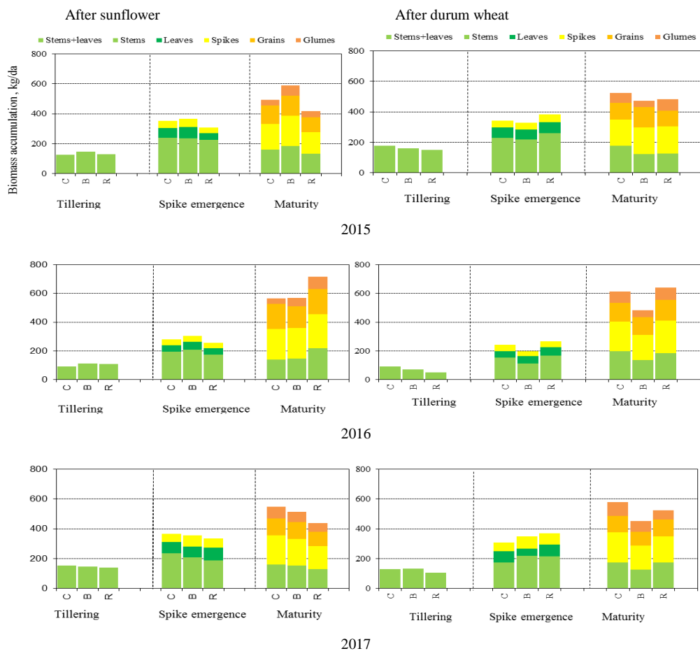
Figure 2. Dry biomass accumulation (C-Colorit; B-Boomerang; R-Respect).

The Boomerang variety has the highest amount of dry biomass - 135.1 and 120.7 kg/da, or 127.9 kg/da compared to the other two (Colorit - 127.5 kg/da, Respect - 112.9 kg/da) after the two predecessors.