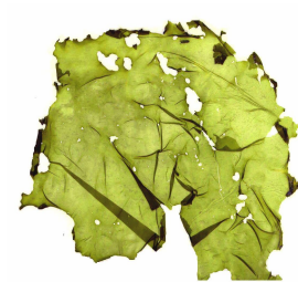
Fig.2. Ulva rigida