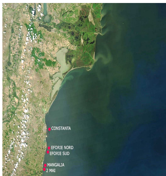
Fig.1. Macroalgal sampling points at the Romanian Black Sea shore

Present research took place in a period of 5 years (2000-2005). Samples of macroalgae were taken from five sites situated along the Romanian Black Sea Shore, between Constanța (in the north) 2 Mai (in the south) (Fig.1). The algal material was collected in different periods of the year, in cold season as well as in warm season, from various types of hard substratum.