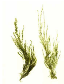
Fig. 4. Cladophora vagabunda

Rhodophyta filum was represented mainly of Ceramium species, Ceramium rubrum being the most abundant, together with Ceramium elegans and Ceramium diaphanum .