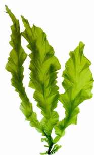
Fig. 3. Enteromorpha intestinalis