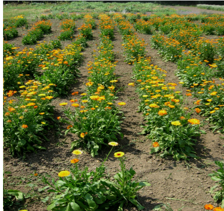
Figure 1- Experimental field of Calendula officinalis L.-Didactical Base of USAB Timisoara

The biometrical measures of flowers diameter infected were made by the ruler (figure 2.).