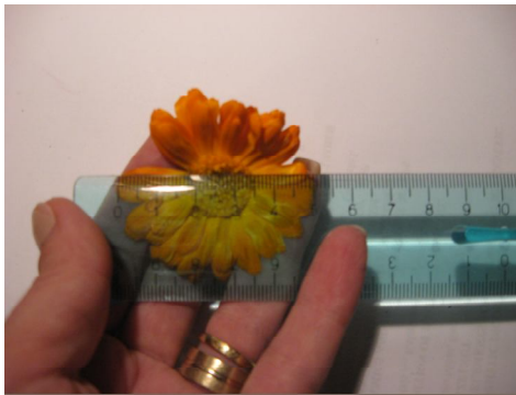
Figure 2- Morphological analysis of the diameter of Calendula officinalis L. flowers

The biometrical measures of flowers diameter infected were made by the ruler (figure 2.).