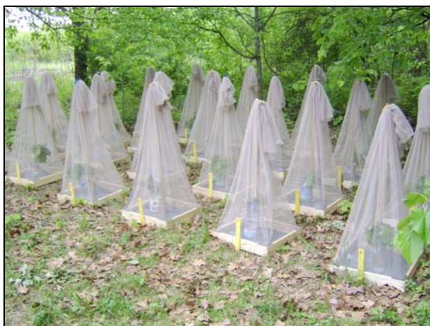
Figure 1. The trial aspects

In each growth box has introduced one twigs with leafs of common oak, in boxes of water to hinder drying. The control was sprinkle with water and next variants with emulsions: emulsion of NeemAzal-T/S in concentration of 0,5%, emulsion of NeemAzal-T/S in concentration of 1%, emulsion of NeemAzal-T/S in concentration of 2%, emulsion of NeemAzal-T/S in concentration of 2% and raps oil 0,1 % for more adherent proprieties, emulsion of NeemAzal-T/S in concentration of 2% and Bacillus thuringiensis var. aizawai 1% (figure 1). On each twig with leafs were been introduce caterpillars in 2 nd age (40 caterpillars/variant, 10 caterpillars/replication). Once of 48 hours was numbered alive caterpillars, in lethargy and death, from each variant.