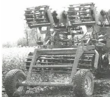
Rollers of independent disc harrow GD-4