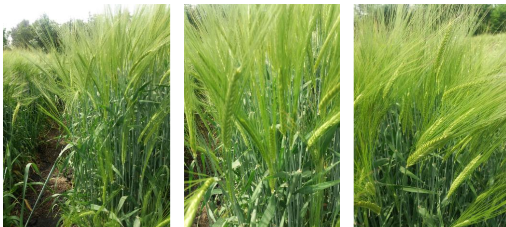
Figure 2. Gorast

/Winter two-rowed, Hordeum vulgare L. sensu lato. Subs. distichum (L.) Korn covar. Distichon (L.) Alef. S.i./ (Figure 2.)