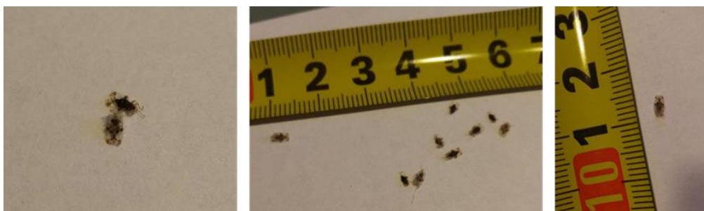
Figure 2. Adults of Corythuca c. collected in August from plants (left and middle); length measurement (right and middle) (photos taken by Grozea during the period August and September, 2019)