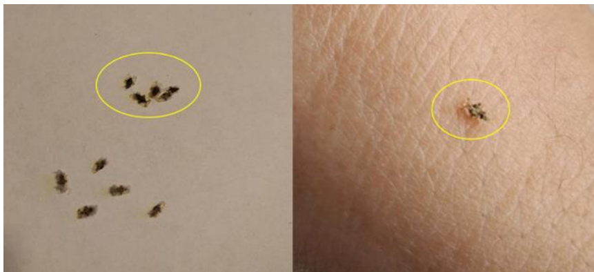
Figure 2 Adult Corythuca c. at the time of the sting (right); adults collected after stinging human skin (left)

In detail, individuals had a chaotic flight and an attraction to human skin. After discussions with 6 people who lived in locations under study, it was concluded that insects had the same manifestations of behavior in the presence of humans. So, adults got on the skin and started pinching at first, annoyingly.