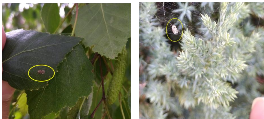
Figure 2. Adult insects of Corythuca ciliata on Betula sp. (left); adult caught in the canva of the spider from (right) Aranea

In August they were present on Platanus and Betula species (figure 2), but in September only in location/ garden 1 were observed numerous specimens (25 adults/plant) on Pinus sp. The specimens from August were observed feeding on the leaf nervures. But those observed in September (at the last 2 readings) no longer fed but were trapped in a canvas of a predatory spider (figure 2). The analyzed pine is located near the house and terrace and probably in search of sheltered and warmer places, the insects migrated towards them and were caught in the canvas of the predatory spider from Aranea . Anyway, they were not observed consuming this type of plant.