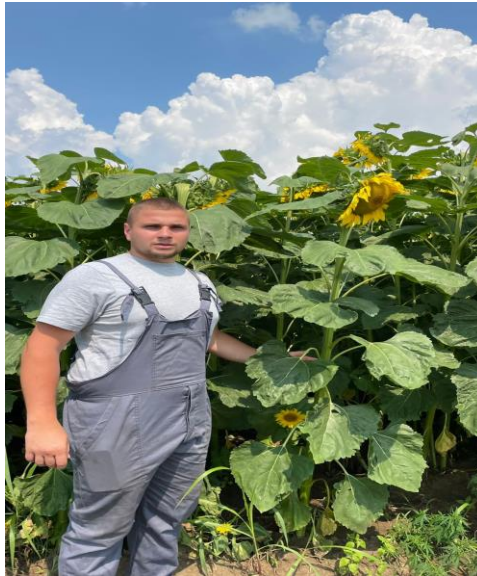
Fig. 1 Sunflower production in 2022

Next, we presented the distribution of the rainfall regime in 2020 and 2021 at the two weather stations, Moldova Veche and Oravita. It is also worth noting the decrease in the rainfall regime in the fall of 2021, compared to 2020, which led to a decrease in both wheat and lead production, the first three months of 2021 were deficient compared to the same period of 2020 For corn we had a decrease of 3.5 t/ha, while for wheat of 3.1 t/ha, in 2022. We also carried out a brief analysis of precipitation and the thermal regime in 2021 and the year 2022.